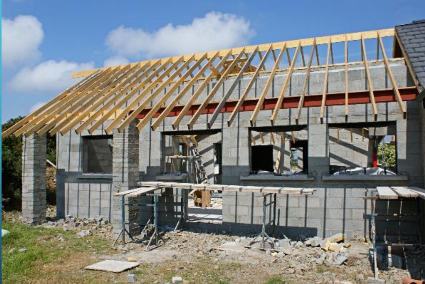
New houses and farm buildings in our Parish