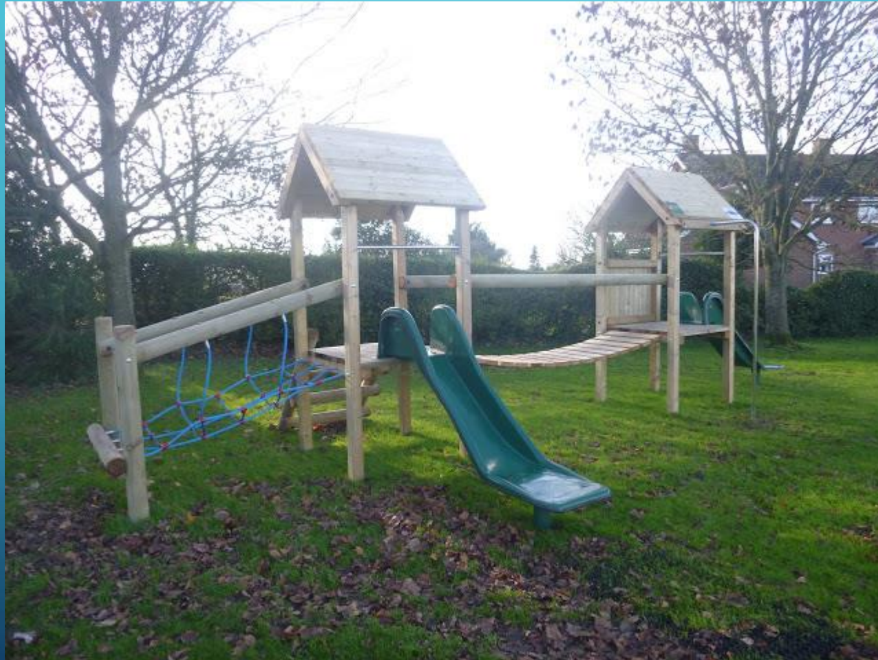
Playground provision, the Green grass cutting, facilities and the Glebe