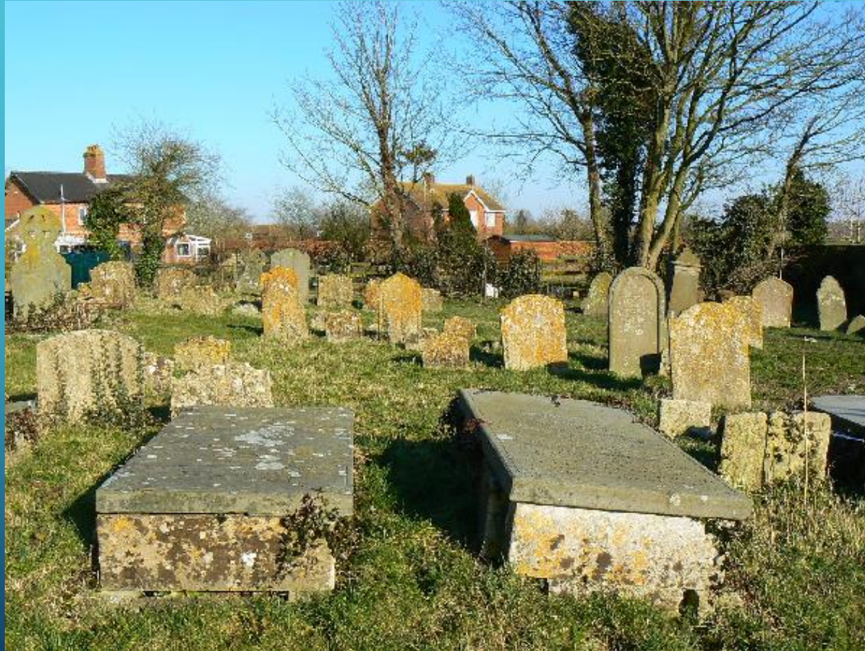
Churchyard maintenance, Graveyard plots and grass cutting